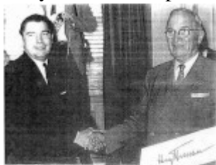
1959 "Citizen of the Year"